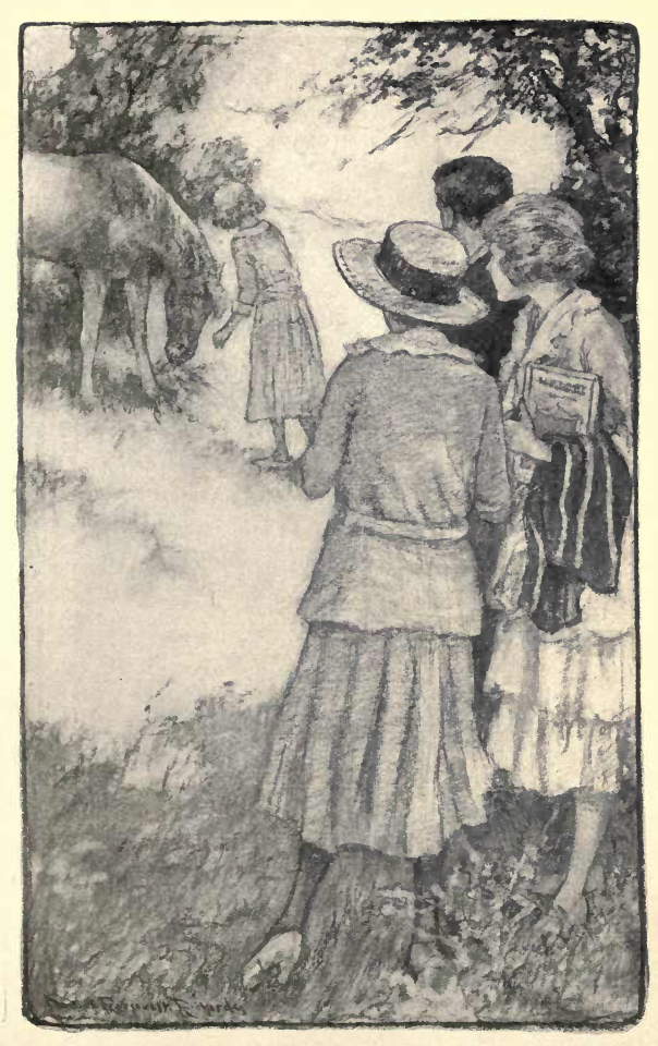
"GULLFAXI, Gullfaxi," WHISPERED APRIL